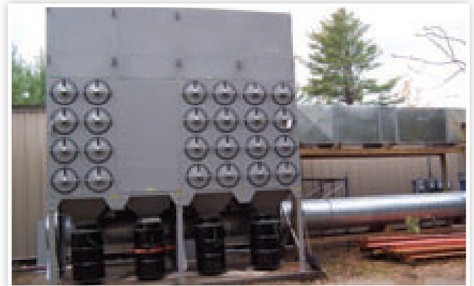
Parker Hannifin custom designed an extended dirty air plenum to collect particles in all shapes and sizes.

The DustHog dust collector has also had a measurable impact on the plant's profitability. The 30 to 45 seconds workers used to spend cleaning their work area between parts has decreased to 10 seconds.