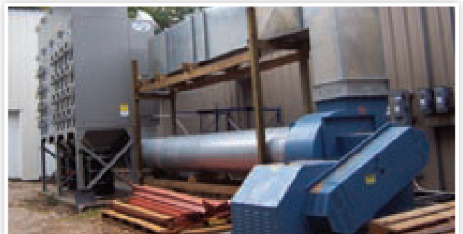
A DustHog SFC 48-4 with an air distribution module and ground mount blower collects plastic dust.

While production has gone up, maintenance costs have gone down. The SFC's "QuickSeal" release door and horizontal filter tracks allow for fast cartridge filter removal. The design of the SFC also allows for easier unloading of collected dust from the 55-gallon storage drums. While this process once took about 3 1/2 hours, it now takes less than 15 minutes.